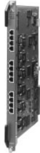
ONcore 24-Port 10BASE-T FastModule and ONcore 12-Port 100BASE-TX Workgroup FastModule